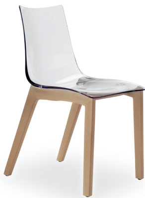
2805 FN 100