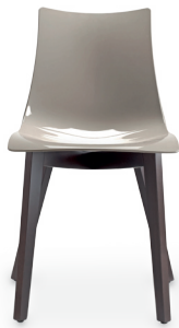
2806 FW 315